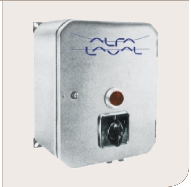
The MAWA 10 cabinet.

The equipment is built into a fully welded, splash-proof cabinet which can be mounted on wall or bulkhead. The cabinet has nipples for the operating air tubes (6/4 mm copper tubing) and terminal board for connecting to separate alarm systems of closed or open circuit type and remote lamp indication. Relays are of plug-in type.